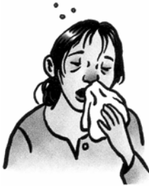
She feels awful . (She feels sick)