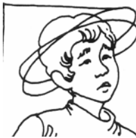
He feels dizzy . (He feels like his head is spinning and he can't balance himself).