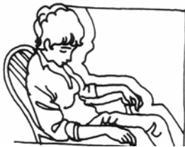
She feels run down . (She feels tired from lack of sleep)