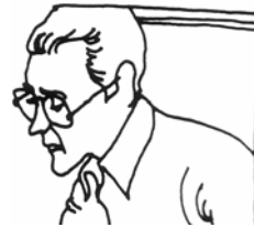
He feels nauseous . (He feels as if he can't keep food down).