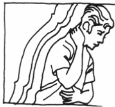
He feels achy all over . (He feels a dull pain all over his body)