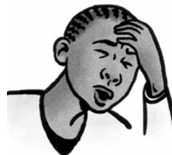
He feels very weak . (He feels like he has no energy in his body).